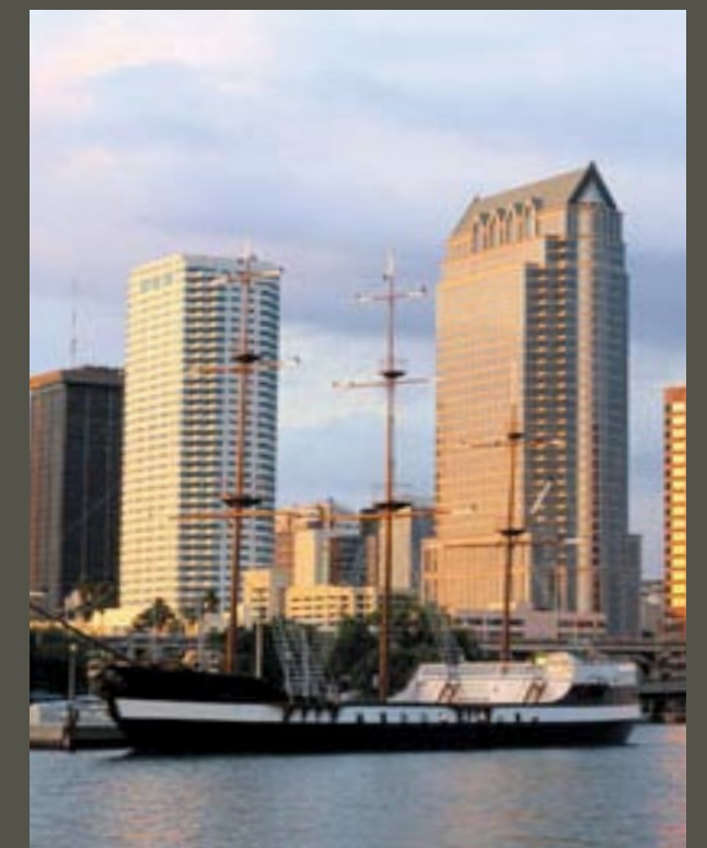
Tampa Bay offers a unique blend of urban excitement in a natural surrounding.